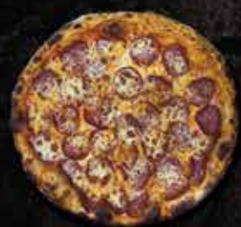
PEPPERONI 14 20 Napoli Sauce, Mozzarella, Pepperoni