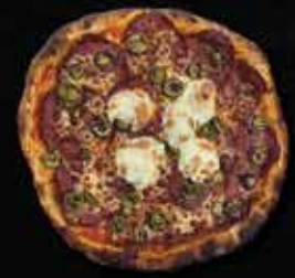
MEXICANA 14 20 Napoli Sauce, Mozzarella, Calabrese Salami, Jalapeño, Oregano, Marinated Green Olives