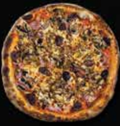
CAPRICCIOSA 14 20 Napoli Sauce, Mozzarella, Virginian Ham, Marinated Mushrooms, Kalamata Olives