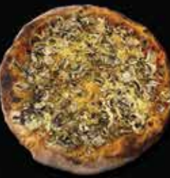
MUSHROOM CLASSIC 13 19 Napoli Sauce, Mozzarella, Mushrooms