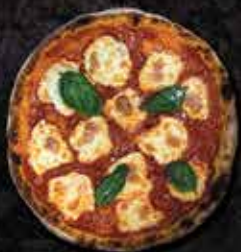
MARGHERITA 13 17 Napoli Sauce, Mozzarella, Parmesan, Basil