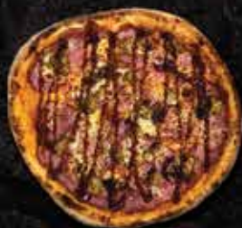
MEAT LOVERS 14 20 Napoli Sauce, Mozzarella, Caramelised Onion, Bacon, Salami, Pork Sausage, BBQ Sauce