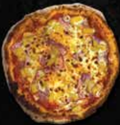
TROPICANA 14 19 Napoli Sauce, Mozzarella, Virginian Ham, Pineapple