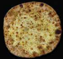
GARLIC 12 16 Garlic Sauce, Mozzarella, Parsley