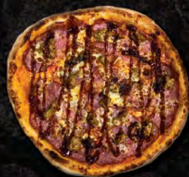
MEAT LOVERS 15 21 Napoli Sauce, Mozzarella, Caramelised Onion, Bacon, Mince Pork, BBQ Sauce