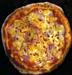
HAWAIIAN/TROPICANA 15 21 Napoli Sauce, Mozzarella, Virginian Ham, Pineapple