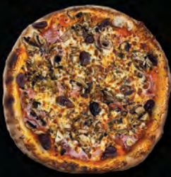
CAPRICCIOSA 15 21 Napoli Sauce, Mozzarella, Virginian Ham, Marinated Mushrooms, Kalamata Olives