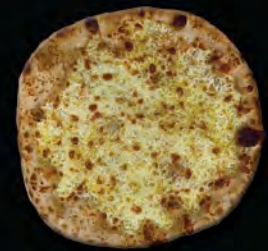
GARLIC 13 18 Garlic Sauce, Oregano, Mozzarella, Parsley