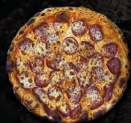
PEPPERONI 15 21 Napoli Sauce, Mozzarella, Pepperoni