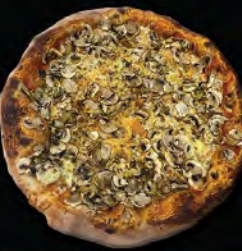
MUSHROOM CLASSIC 14 20 Napoli Sauce, Mozzarella, Mushrooms