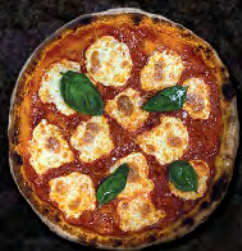
MARGHERITA 14 18 Napoli Sauce, Mozzarella, Parmesan, Basil