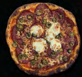
MEXICANA 15 21 Napoli Sauce, Mozzarella, Calabrese Salami, Jalapeño, Marinated Green Olives